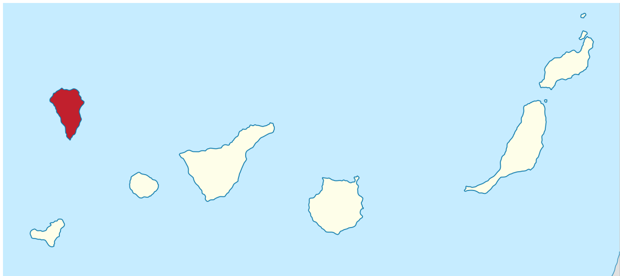
Figure 2: Locations of earthquakes on La Palma since 2017